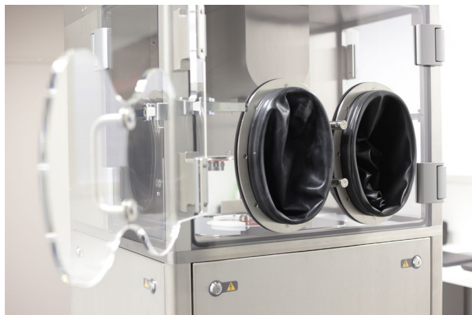
Figure 2: Glove ports for STYL'One EVO Enhanced Operator Safety (EOS)

Even though tablet presses deal with powder in a loose state which can spread in the air, the outcome itself the tablet, is less prone to release loose particles in the ambient.