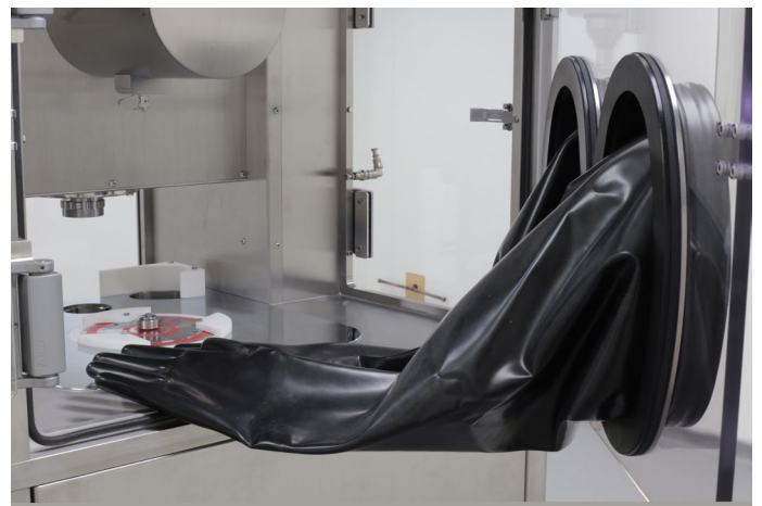
Figure 3: Reinforced seals for nitrogen flooding

The concept is quite unique: The R&D press is fully running inside the isolator which is a contained R&D space of its own. The STYL'One EVO is operated through glove ports. At the same time tablets already produced can be weighed and measured inside the isolator.