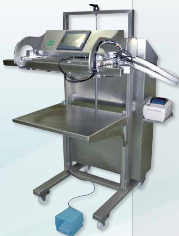
MSB11P ID PHARMA SEALING MACHINE Complies with ISO7 Class Clean rooms

Sealing machines use mechanical or pneumatic systems, with vacuum, gas flushing & Impulse Driver® technologies. We develop custom-made sealers (ATEX, special frames...) according to your needs.