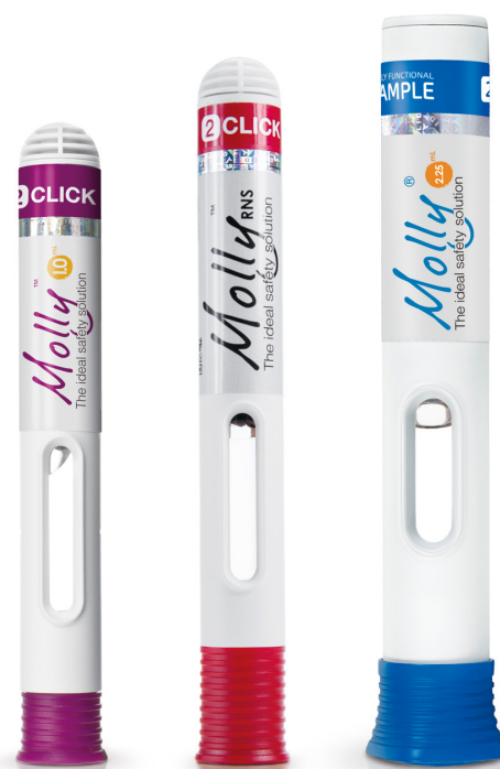
Figure 3: The Molly® family of devices (from left to right): Molly 1.0 mL FNS, Molly 1.0 mL RNS and Molly 2.25 mL.

Cartridges offer a broad range of options for fulfilling various drug characteristics and therapeutic needs, widening the scope of container choices, including for both single- and dual-chamber therapy solutions. However, because their needles are not pre-attached, they do pose a challenge in terms of avoiding contamination and preventing needlestick injuries. SHL addresses this problem with Needle Isolation Technology (NIT®), a unique safety solution where the needle is pre-installed in the device. In one