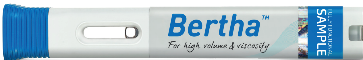
Figure 1: Bertha® is a disposable autoinjector that can safely deliver drugs with viscosities of up to 60 centipoise.