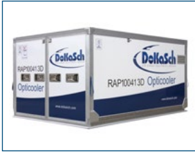
DOKASCH (RAP) +2°C/+30C