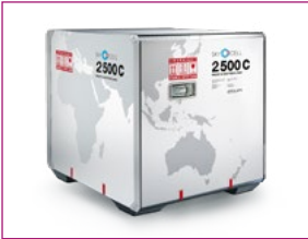
SKYCELL (2500C, 2500CRT, 1500C, 1500CRT, 770C, 770CRT) Passive container +2°C/+25°C

AirBridgeCargo offers different types of comprehensive solutions for temperature-sensitive cargo, using active and passive containers.