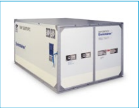
ENVIROTAINER T2 (RAP) Refrigerated container -20°C/+20°C