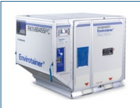
ENVIROTAINER E1 (RKN) 0°C/+25°C