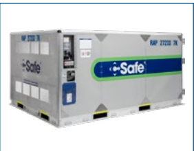
C-SAFE (RAP) +4°C/+25°C