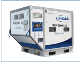
DOKASCH (RKN) +2°C/+30C