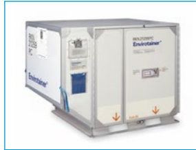
ENVIROTAINER T2 (RKN) Refrigerated container -20°C/+20°C