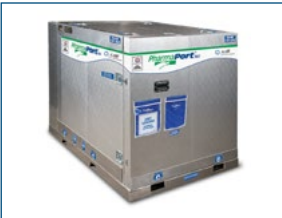
SONOCO THERMOSAFE PHARMAPORT® 360 Precise 5°C Temperature Control

AirBridgeCargo utilizes the following containers to offer optimal healthcare cargo solutions :