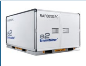
ENVIROTAINER E2 (RAP) -20°C / 20 °C