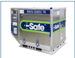
C-SAFE (RKN) +4°C/+25°C