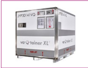
VA-Q-TAINER (XLX, TWINX) Passive container -70°C/+25°C